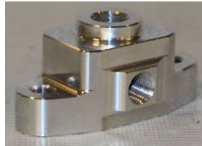
CBM Motorsports Oil Adapter (CBM-10820)