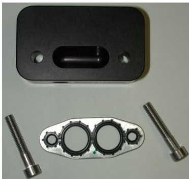
Lingenfelter Turbo Supercharger Oil Supply Block